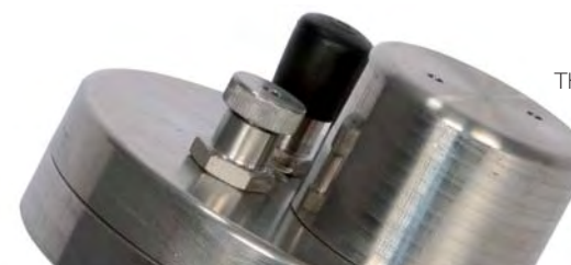
The G.P.S. sensor is the heart of the GPS Plus perimeter protection system patented by GPS Standard.

Today we can guarantee a presence at both a national and an international level with subsidiaries, associated companies and a network of specialist partners.